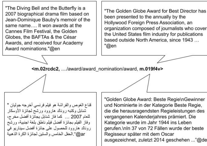
Fig. 1: A triple in FB15K with multilingual descriptions of the head and tail entities from Freebase.

In most of the popular KGs, a single entity can have descriptions in two or more languages where the contents of the descriptions are different. This fact is demonstrated in Figure 1 using, as an example, a triple from FB15K with some of the descriptions of its head and tail entities extracted from Freebase. In this example, it can be seen that, for both the head ('m.02rcdc2') and tail ('m.019f4v') entities, the description provided in one language contains information that is not available in the description given in the other language. Hence, a KGE model which uses entity descriptions only in one language discards the extra information provided in the descriptions in other languages.